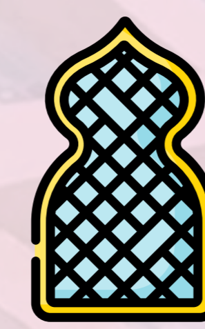
the Dome of the Rock (691)