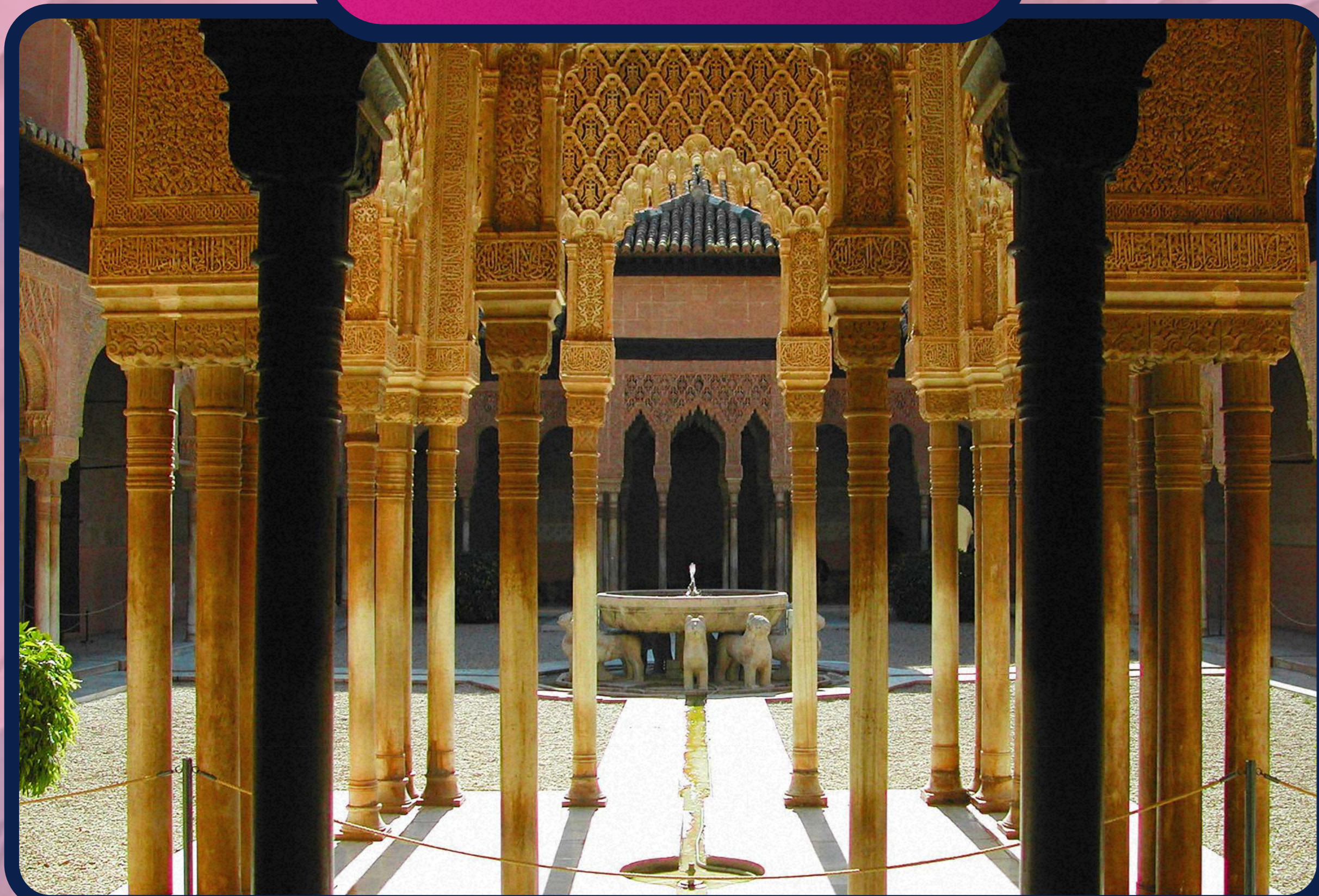
Nasrid Palaces, Alhambra (1300s)