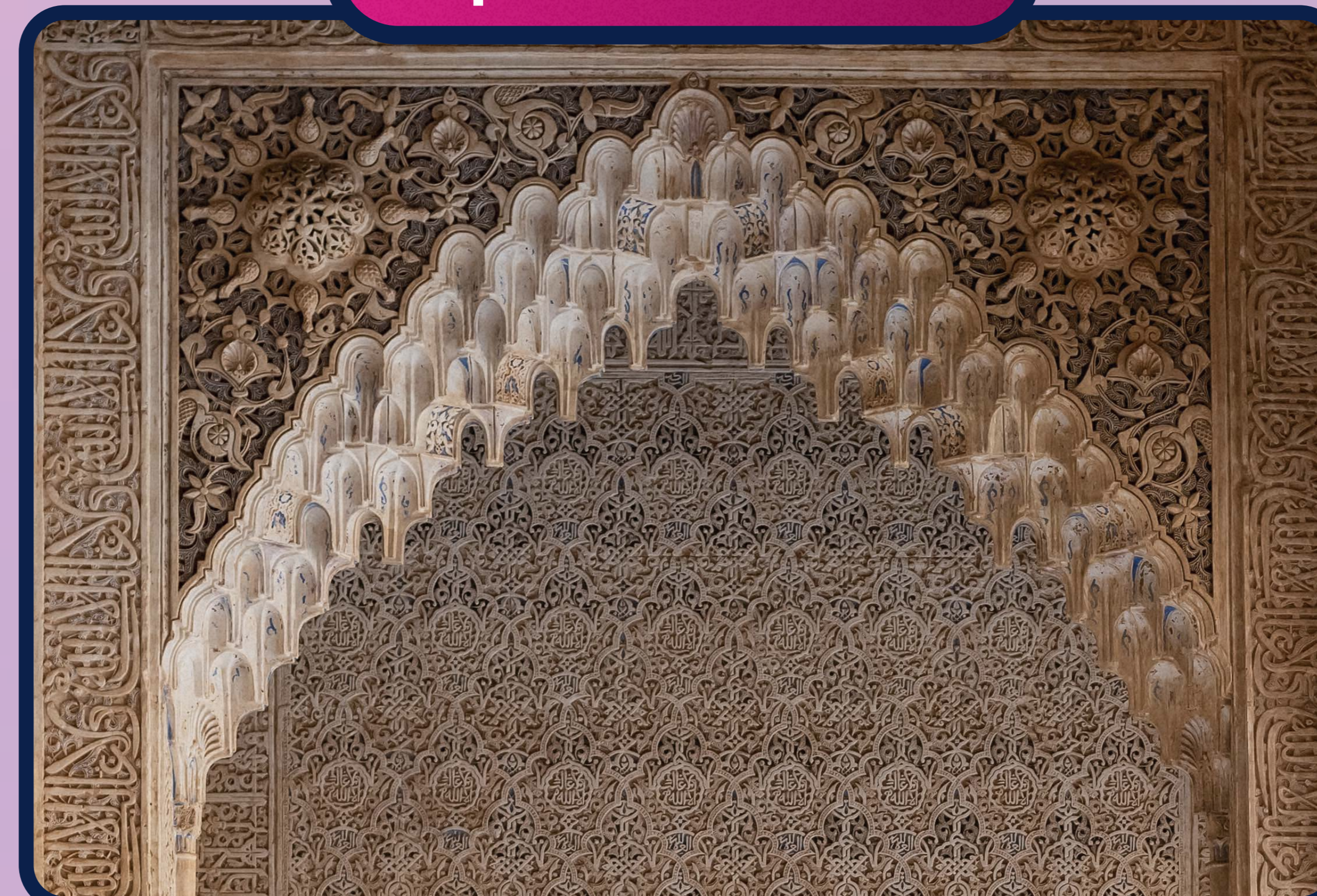
Nasrid Palaces, Alhambra (1300s)