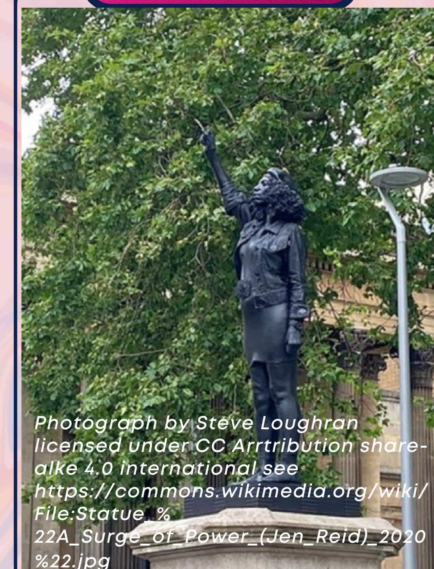
Marc Quinn/Jen Reid