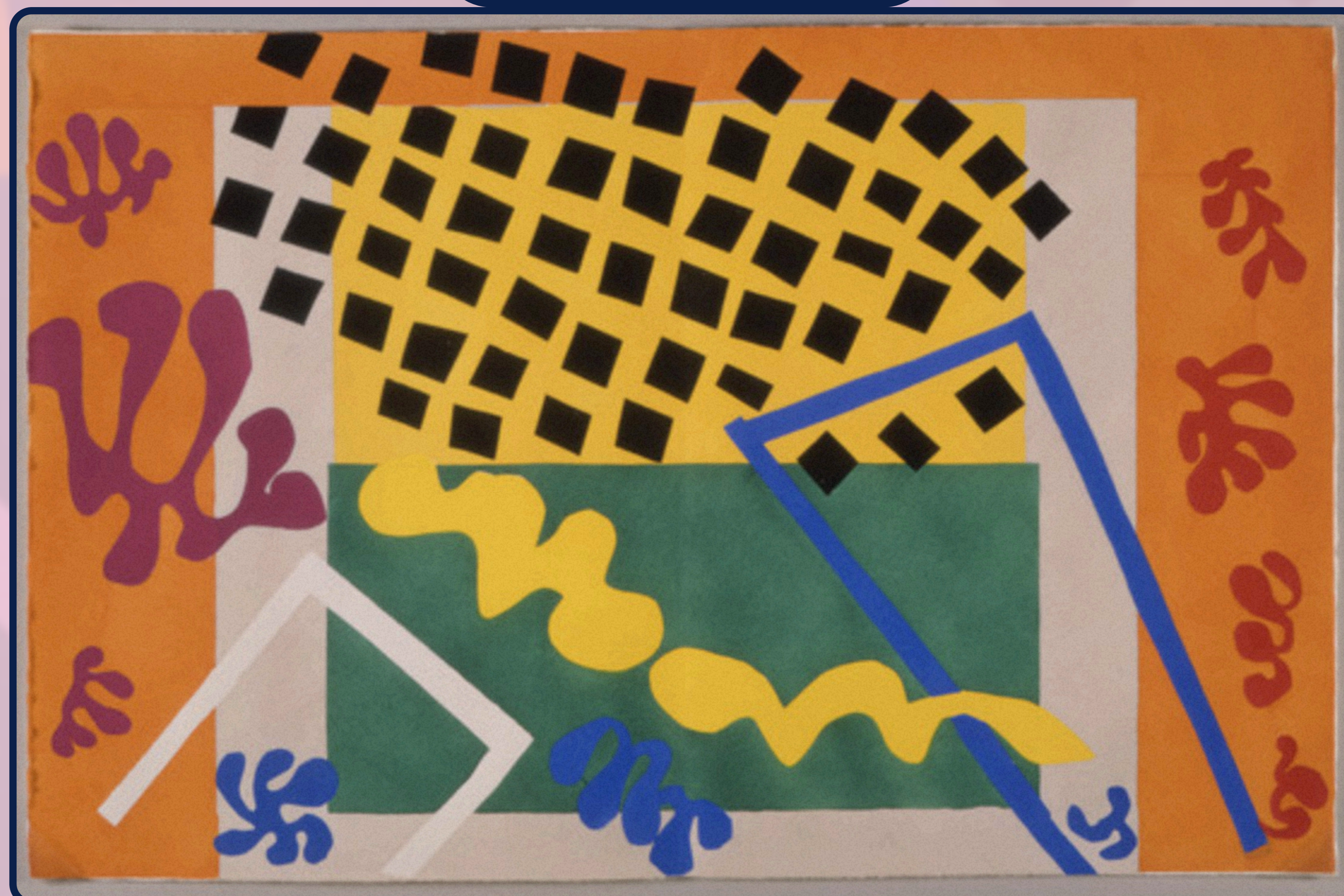
Les Codomas (two famous trapeze artists) 1947

© 2021 Succession H. Matisse / Artists Rights Society (ARS), New York