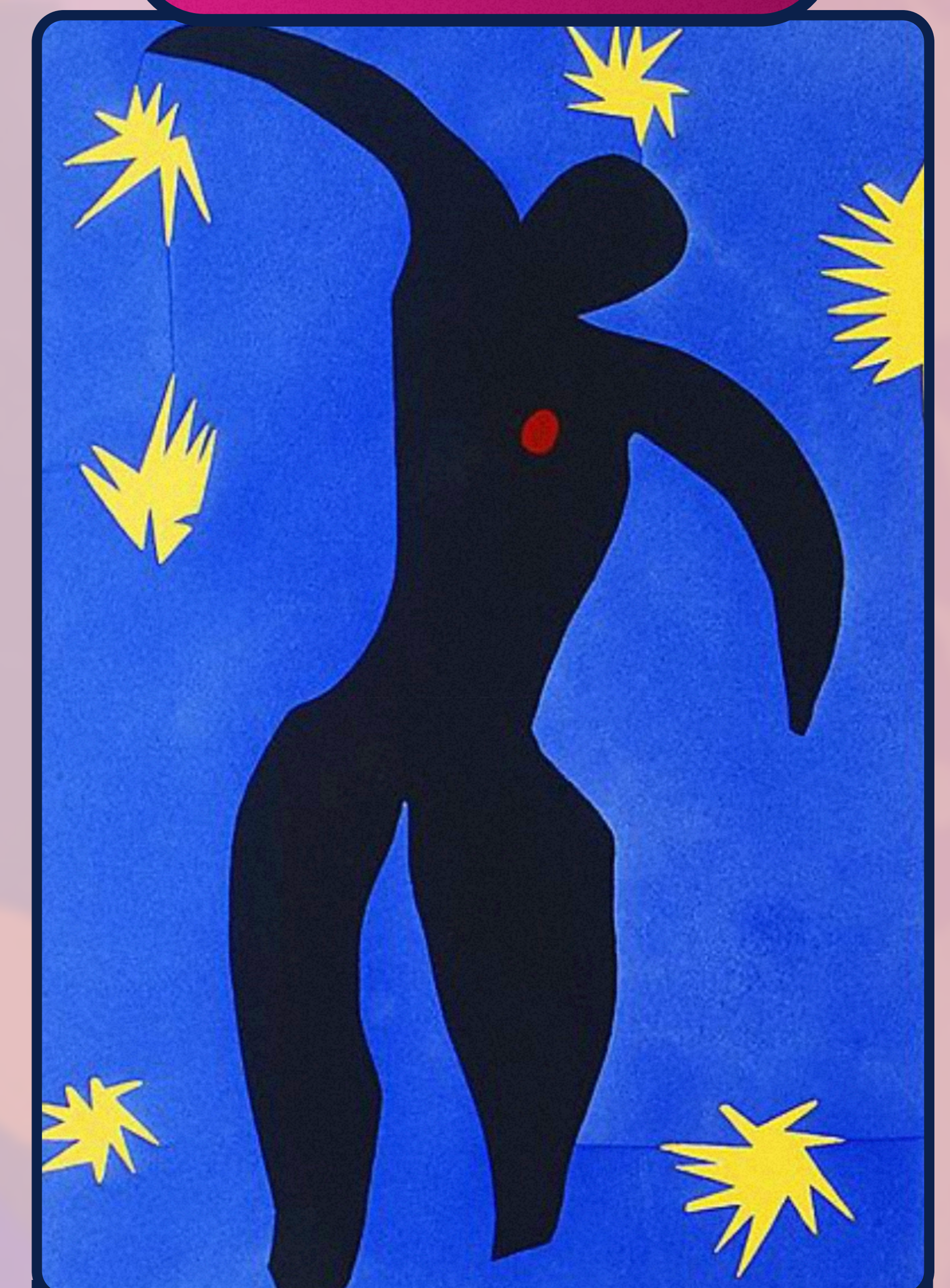
The Fall of Icarus 1947

© 2021 Succession H. Matisse / Artists Rights Society (ARS), New York