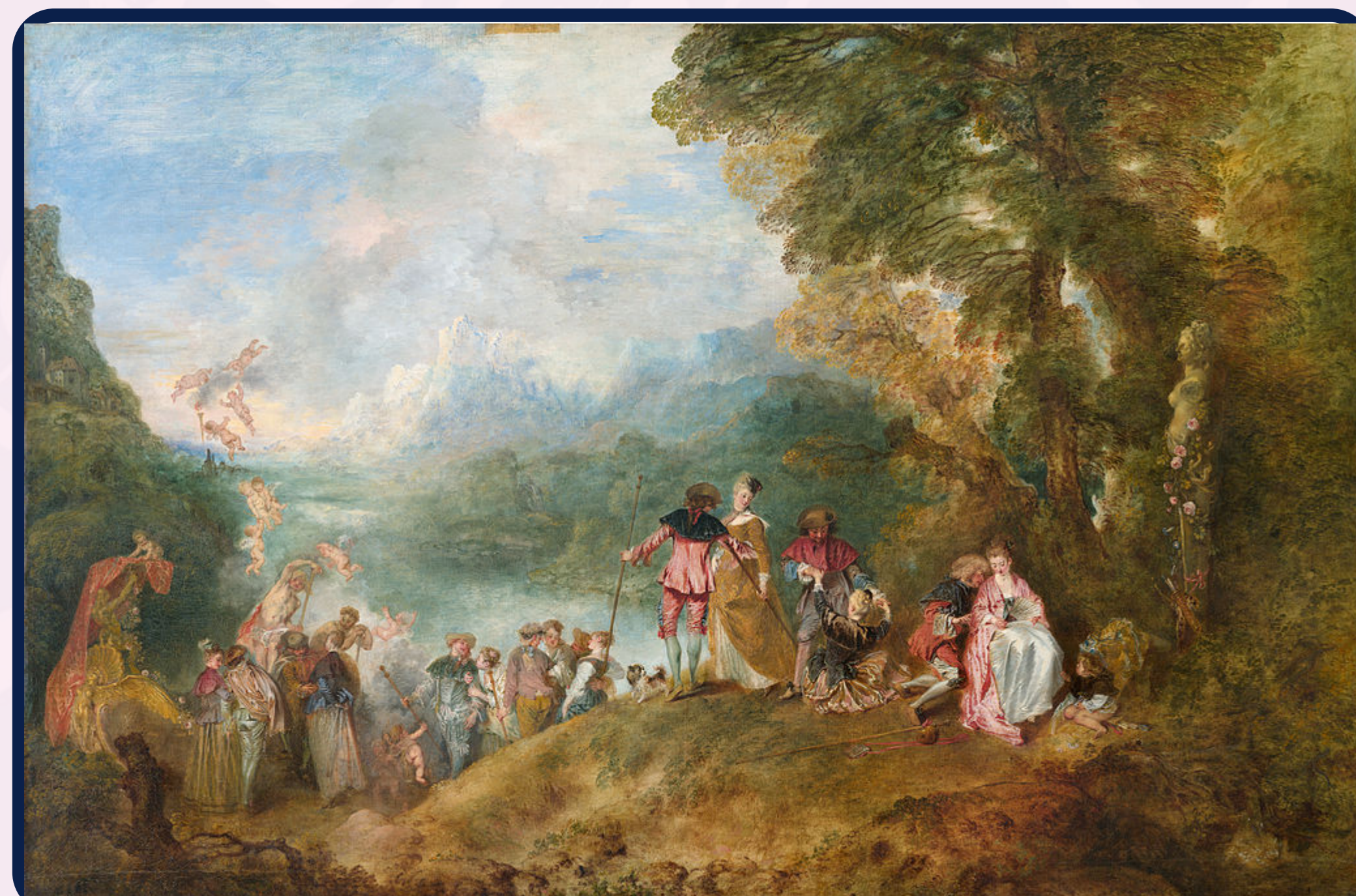
The Pilgrimage to the Isle of Cythera (1717)